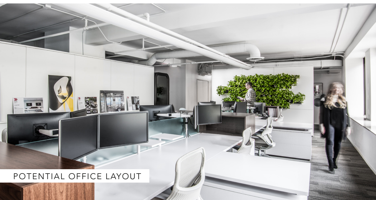
POTENTIAL OFFICE LAYOUT